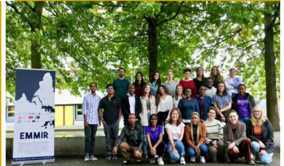
Caption: Edition 10, starting in September 2022, brings 28 students from 19 different countries.

Students experience a multidisciplinary education between the nine partners.